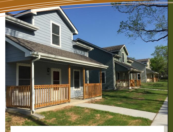
部 "Breaking the cycle of Homelessness 第二十章 Cne Family at a Time"

Monday - Friday 8-5 785-232-1650 1195 SW Buchanan, Ste. 103 Topeka, KS 66604