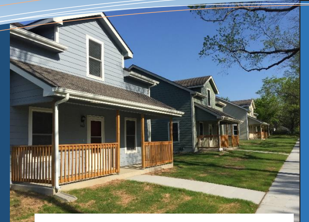
間 "Breaking the cycle of Homelessness 第二次 Che Family at a Time"

OFFICE HOURS: Monday - Friday 8-5 785-232-1650 1195 SW Buchanan, Ste. 103 Topeka, KS 66604